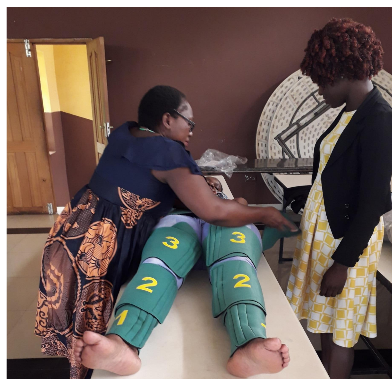
GAIN trainees practice applying the Non-Pneumatic Anti-Shock Garment (NASG) at the nurse leadership training launch in Blantyre District