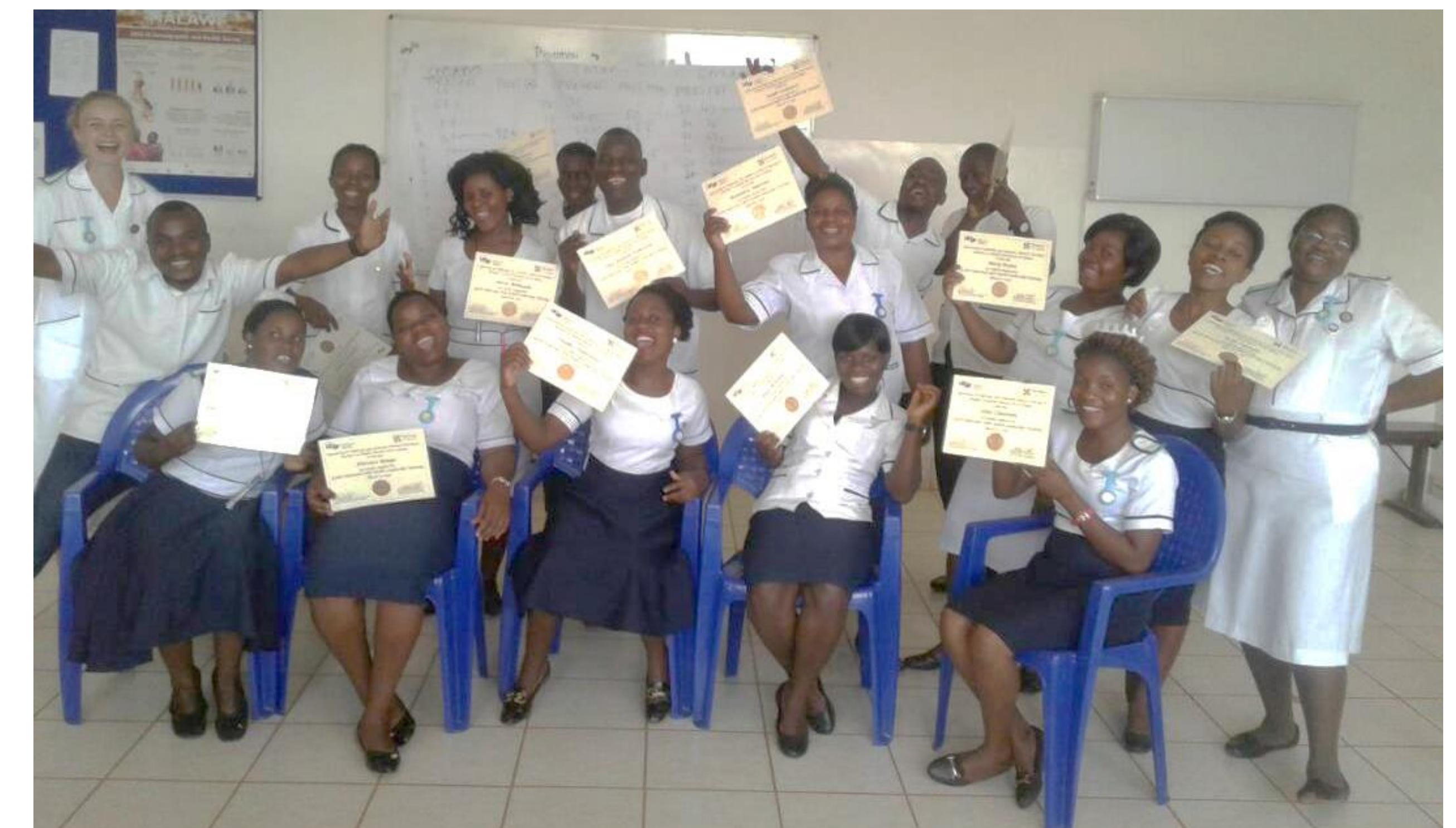
The second cohort of GAIN nurse-midwife trainees in Neno District celebrates after receiving their completion certificates.